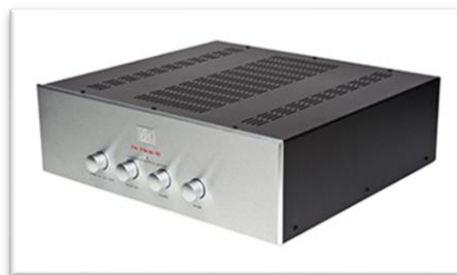
Parallel Single Ended, EL84: