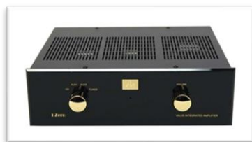
Push Pull ECL82: