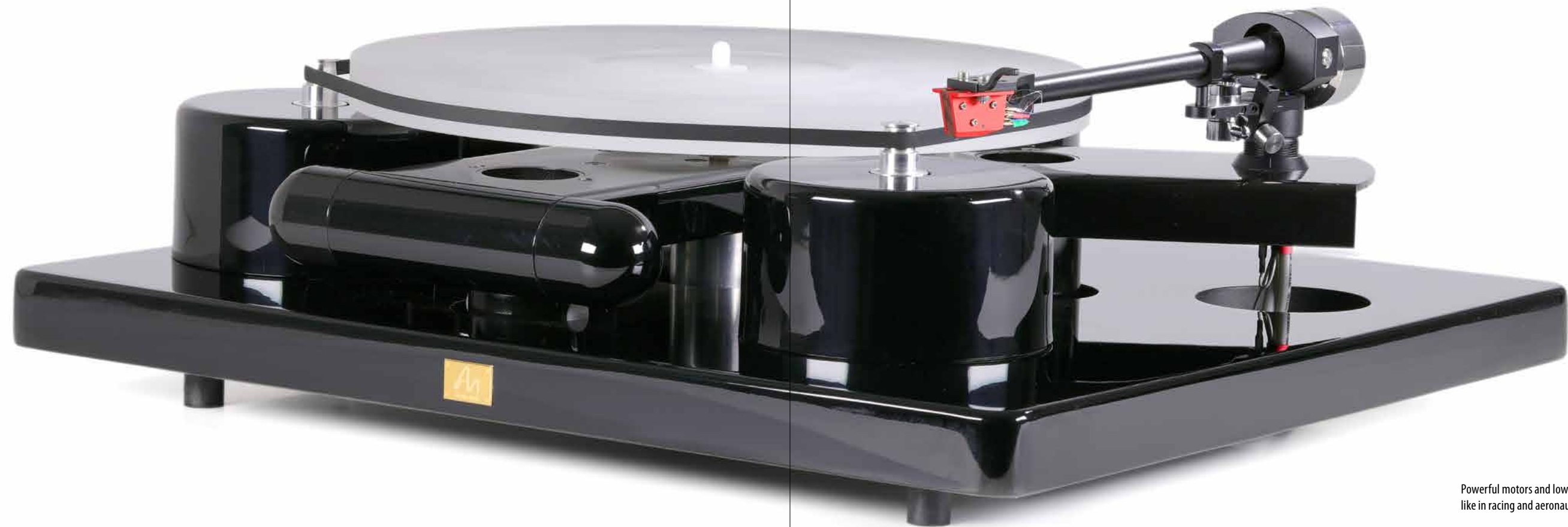
Powerful motors and low moving masses—like in racing and aeronautics.

enormous, and technically complex) Reference MkII also feature in Audio Note's smaller turntables. Even their smallest drive, the TT One, benefits from the expert mechanical "energy management" of their largest device. While the visually similar TT Two (which is equipped with two opposing AC motors) has proven to be a reliable music machine that sounds so good it should probably have entertainment tax slapped on it, and can give the big boys a real run for their money. There are even several versions of the larger model, the TT Three ("TurnTable Three"). In addition to the rather grandiose flagship model, the "Three Reference," there's also a streamlined "Three .5 Reference," referred to in-house as the "Half Reference." Though according to