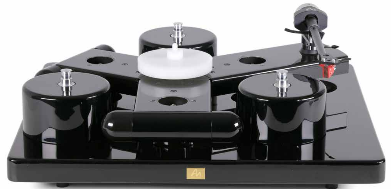
Drive motors and sub-chassis wings in equilateral configuration.

In 2018, ebm-papst began supplying “suitable” motors again, whereby the new drives are being heavily modified and synchronized at Audio Note UK. The TT Three presented here is the smallest of the three models in the current 3 series.